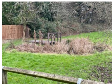
Site for new concrete and fibre glass lined pond

On behalf of Kibworth Joint Recreation Board I helped the clerks apply for section 106 funding in 2021/22 for inclusive play equipment for a small play area off Smeeton Road, a new concrete and fibre glass lined pond in Rookery Close Park and a tarmac pathway through Smeeton Road Recreation Park. As of May 2022, funding has been approved for the inclusive play equipment, the pond and the tarmac pathway. Further applications are due to be produced in 2022 for a trim trail, zipwire and skatepark.